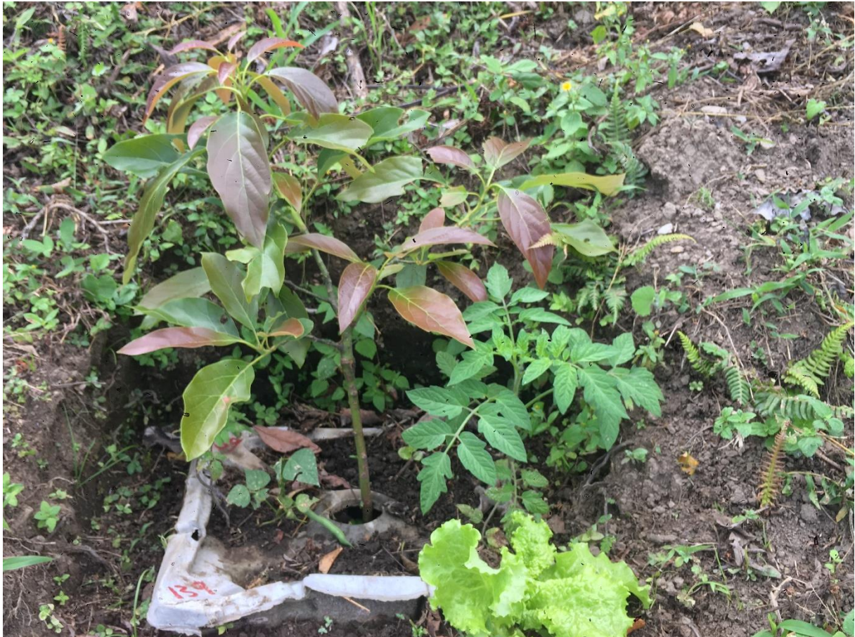
GB # 139 –Avocado of 78 cm + 2 tomatoes Chonto + 1 crispy lettuce – Photo taken on June 19 th 2019, in Achiral.

Groasis has been designated as National Icon by the Dutch Government for being one of the 3 most innovative projects of The Netherlands with a high social impact and supporting economic growth.