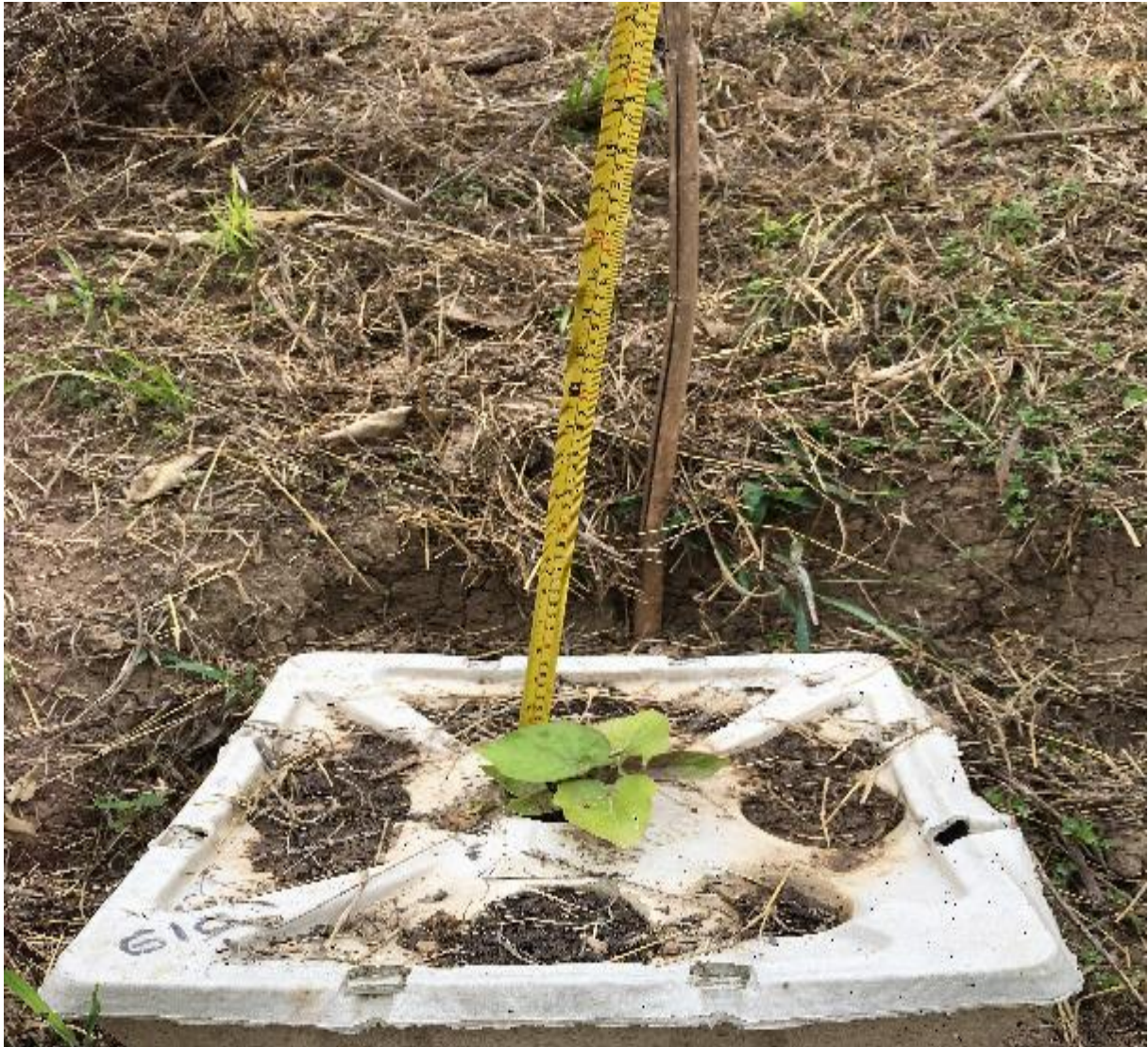
GB # 610 – tree tomato of 6 cm + 2 beans. Photo taken on March 12 th 2019, in Altillo.

Groasis has been designated as National Icon by the Dutch Government for being one of the 3 most innovative projects of The Netherlands with a high social impact and supporting economic growth.