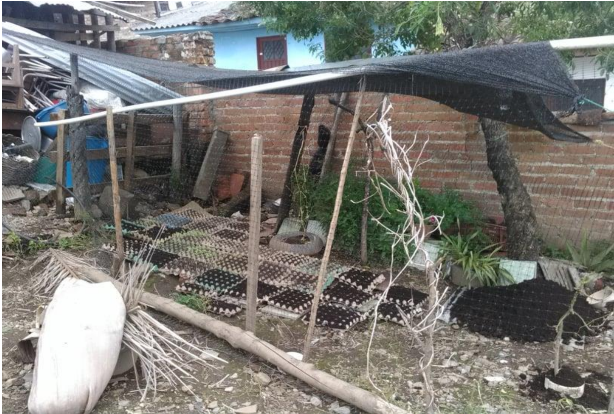
Photos of the germinating vegetables, located under poly-shadow.

Groasis has been designated as National Icon by the Dutch Government for being one of the 3 most innovative projects of The Netherlands with a high social impact and supporting economic growth.