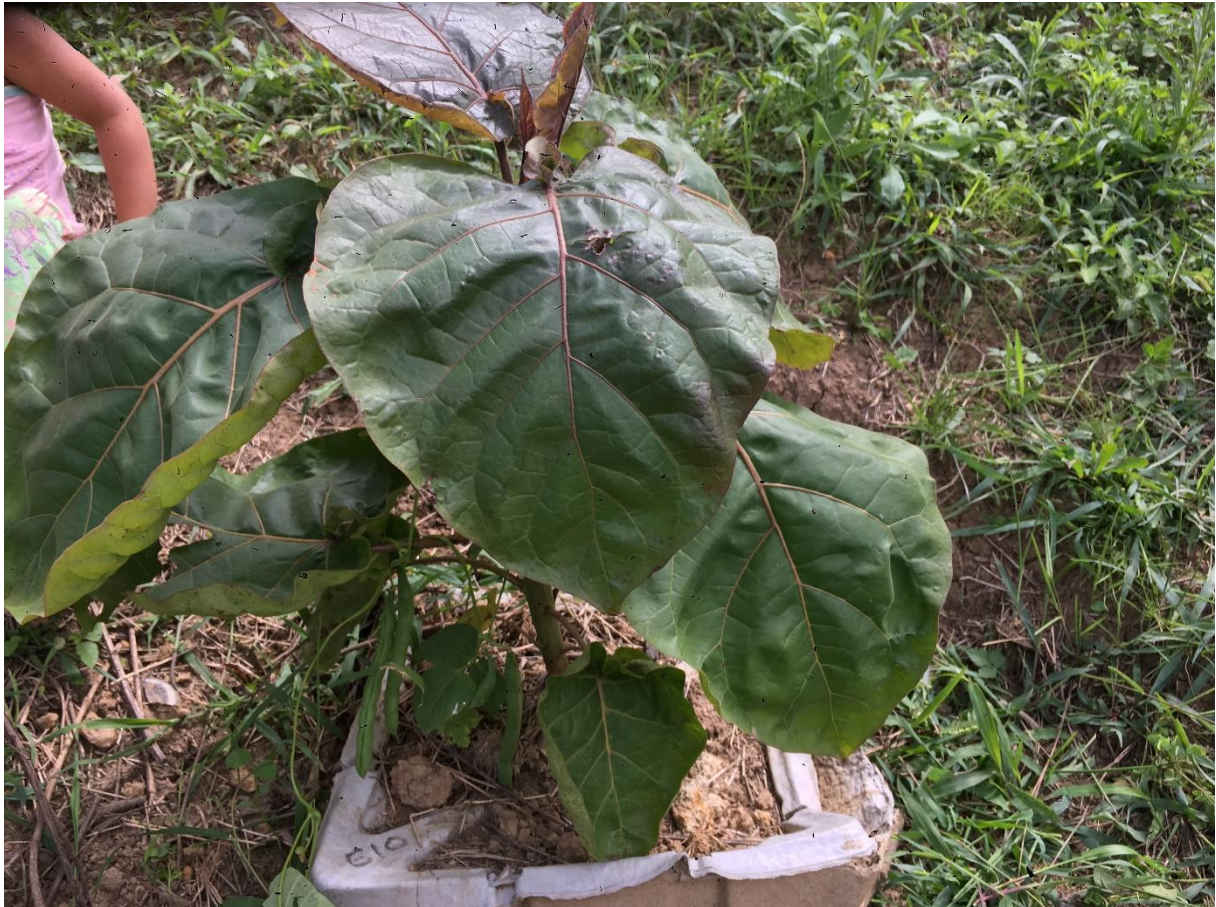
GB # 610 – tree tomato of 79 cm + beans. Photo taken on June 18 th 2019, in Altillo.

Groasis has been designated as National Icon by the Dutch Government for being one of the 3 most innovative projects of The Netherlands with a high social impact and supporting economic growth.