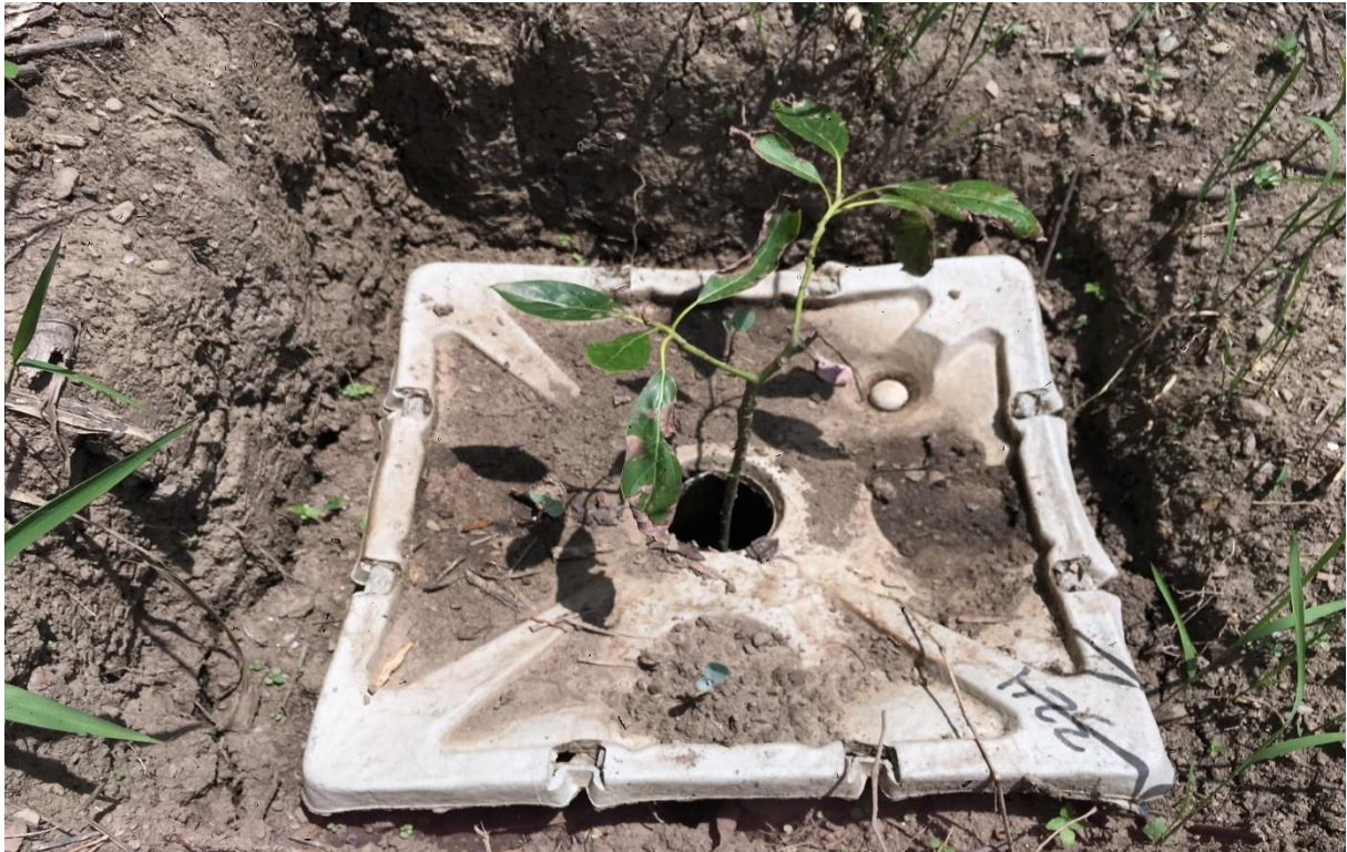
Gb # 324 Avocado + cabbages. Photo taken on March 13 th 2019 in Gonzalo.

Groasis has been designated as National Icon by the Dutch Government for being one of the 3 most innovative projects of The Netherlands with a high social impact and supporting economic growth.