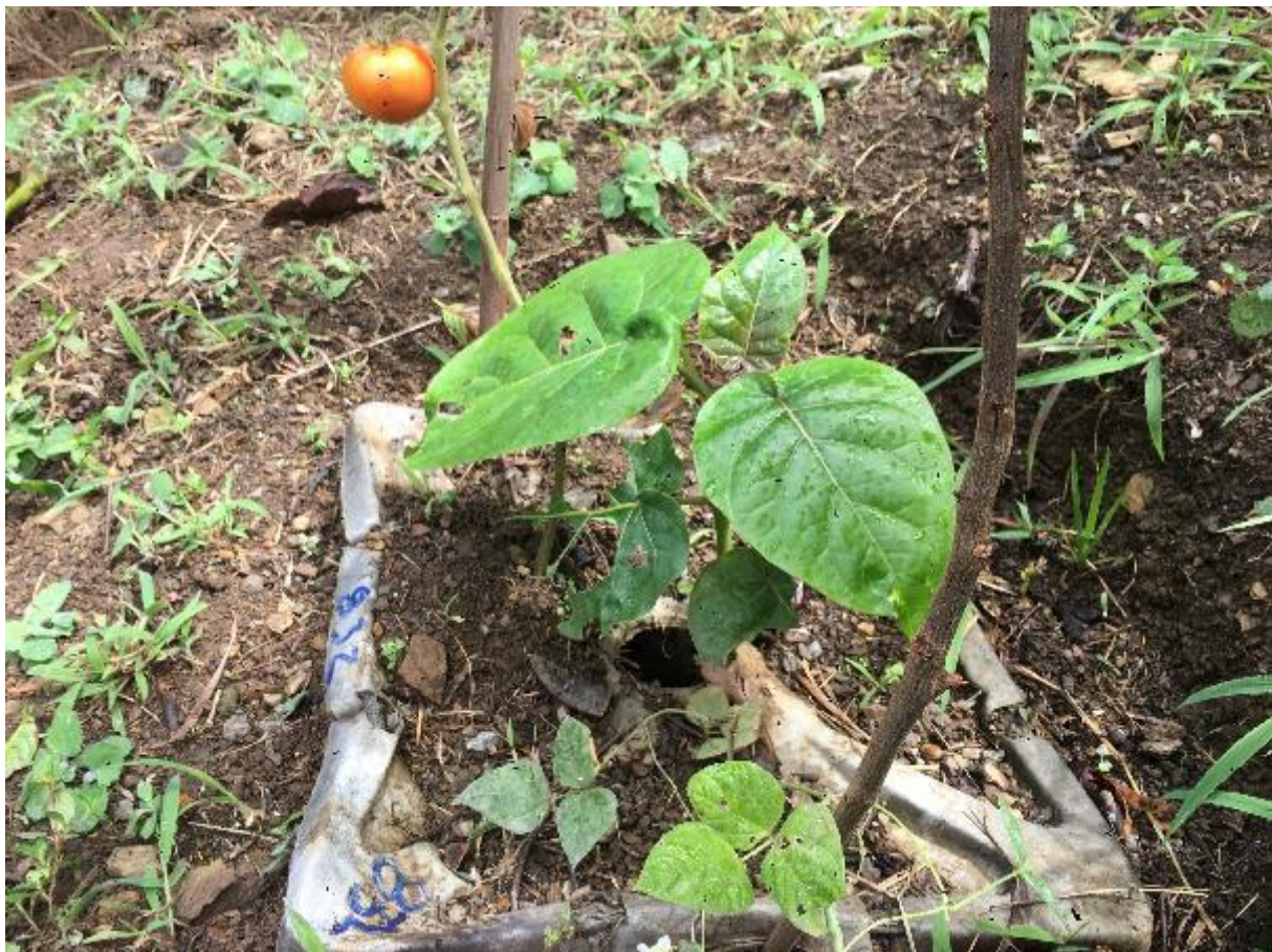
GB # 832 tree tomato of 43 cm + 1 tomato Chonto + 1 beans. Photo taken on June 20 th 2019, in site 2 of Juan Ruiz.