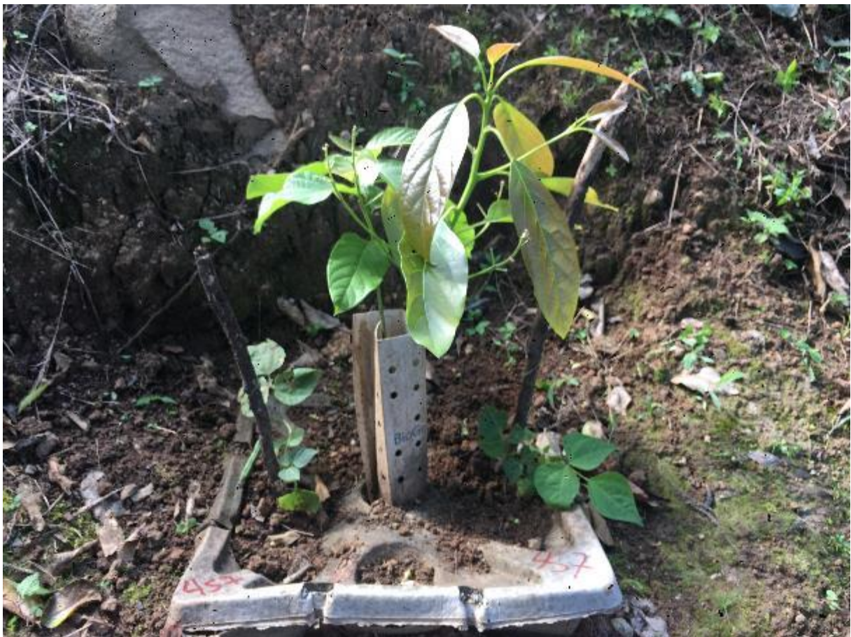
GB # 457 –Avocado of 65 cm + 2 beans. Photo taken on June 18 th 2019, in Yunga.

Groasis has been designated as National Icon by the Dutch Government for being one of the 3 most innovative projects of The Netherlands with a high social impact and supporting economic growth.