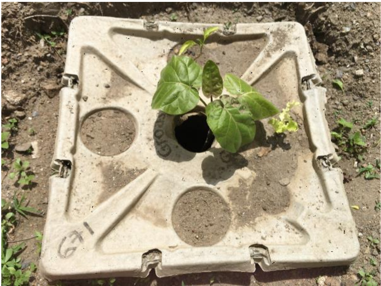
GB # 671 –Tree tomato + crispy lettuce + green pepper – Photo taken on March 11 th 2019, in La Herradura.

Groasis has been designated as National Icon by the Dutch Government for being one of the 3 most innovative projects of The Netherlands with a high social impact and supporting economic growth.