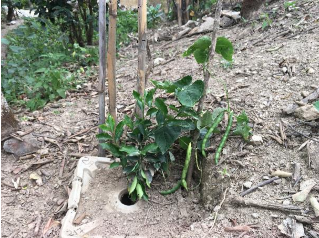
GB # 217 – Tangerine of 58 cm + beans – Photo taken on June 17 th 2019, in Casablanca.

Groasis has been designated as National Icon by the Dutch Government for being one of the 3 most innovative projects of The Netherlands with a high social impact and supporting economic growth.