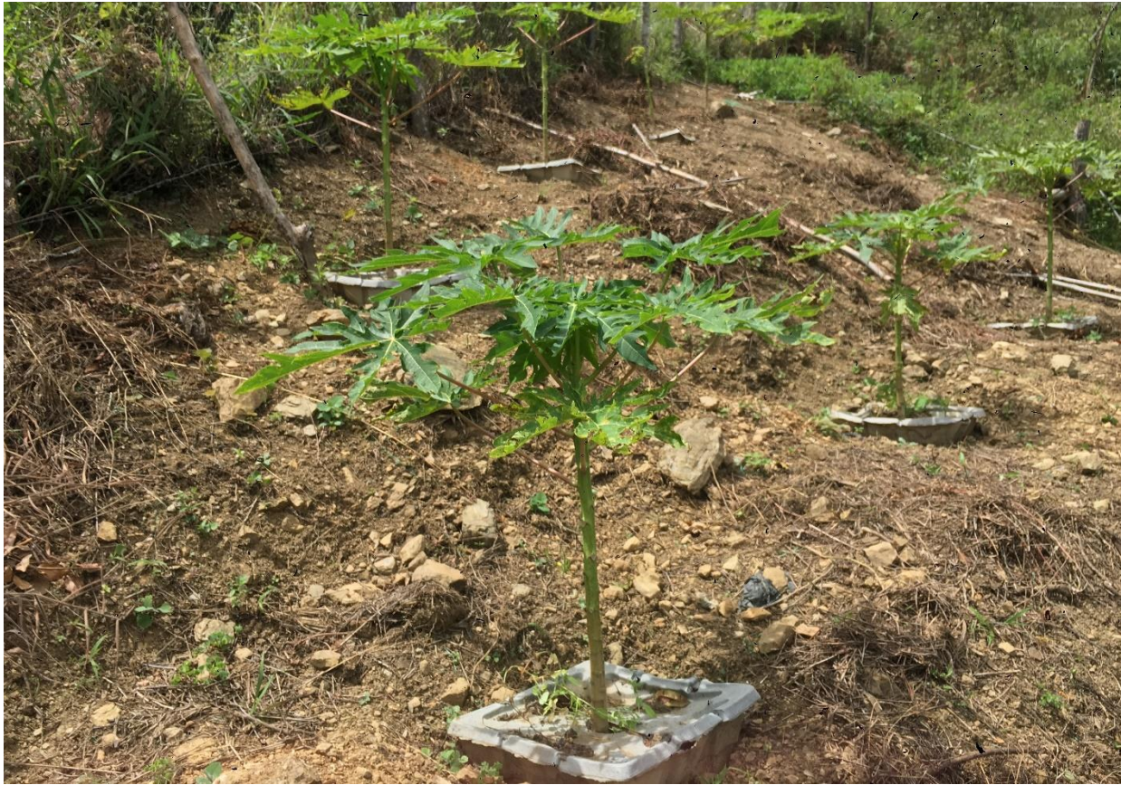
View of Growboxx with papaya trees in Gonzalo's lot, in the community garden. Photo taken on June 19th. 2019.

Groasis has been designated as National Icon by the Dutch Government for being one of the 3 most innovative projects of The Netherlands with a high social impact and supporting economic growth.