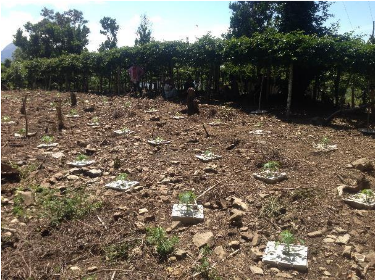
View of the crop with Growboxx - Photo taken on March 13 th 2019, in Palizada.

Groasis has been designated as National Icon by the Dutch Government for being one of the 3 most innovative projects of The Netherlands with a high social impact and supporting economic growth.