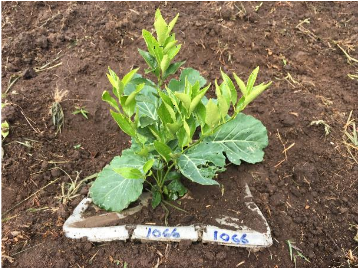
GB # 1066 Tangerine of 60 cm + 1 cabbage. Photo taken on June 21th 2019, Cerro Largo.

Groasis has been designated as National Icon by the Dutch Government for being one of the 3 most innovative projects of The Netherlands with a high social impact and supporting economic growth.