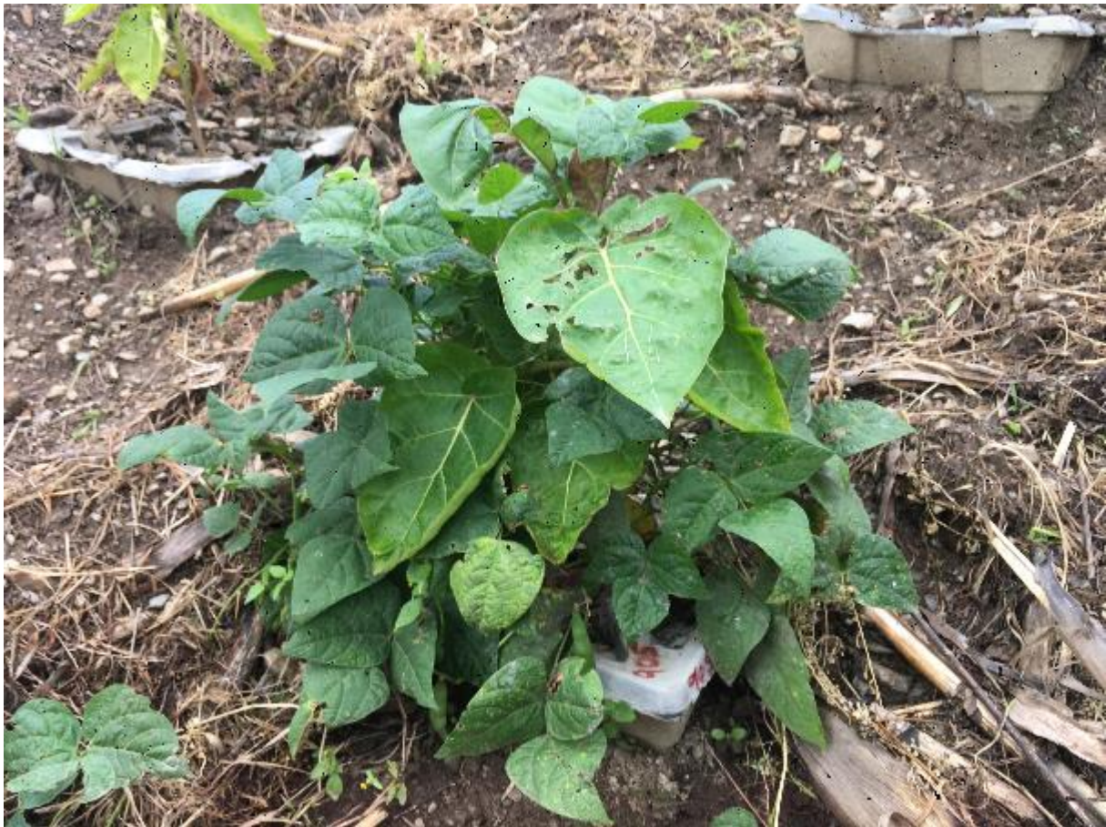
GB # 905 tree tomato of 54 cm + 2 beans. Photo taken on June 21th 2019 in Gabrielas.

Groasis has been designated as National Icon by the Dutch Government for being one of the 3 most innovative projects of The Netherlands with a high social impact and supporting economic growth.