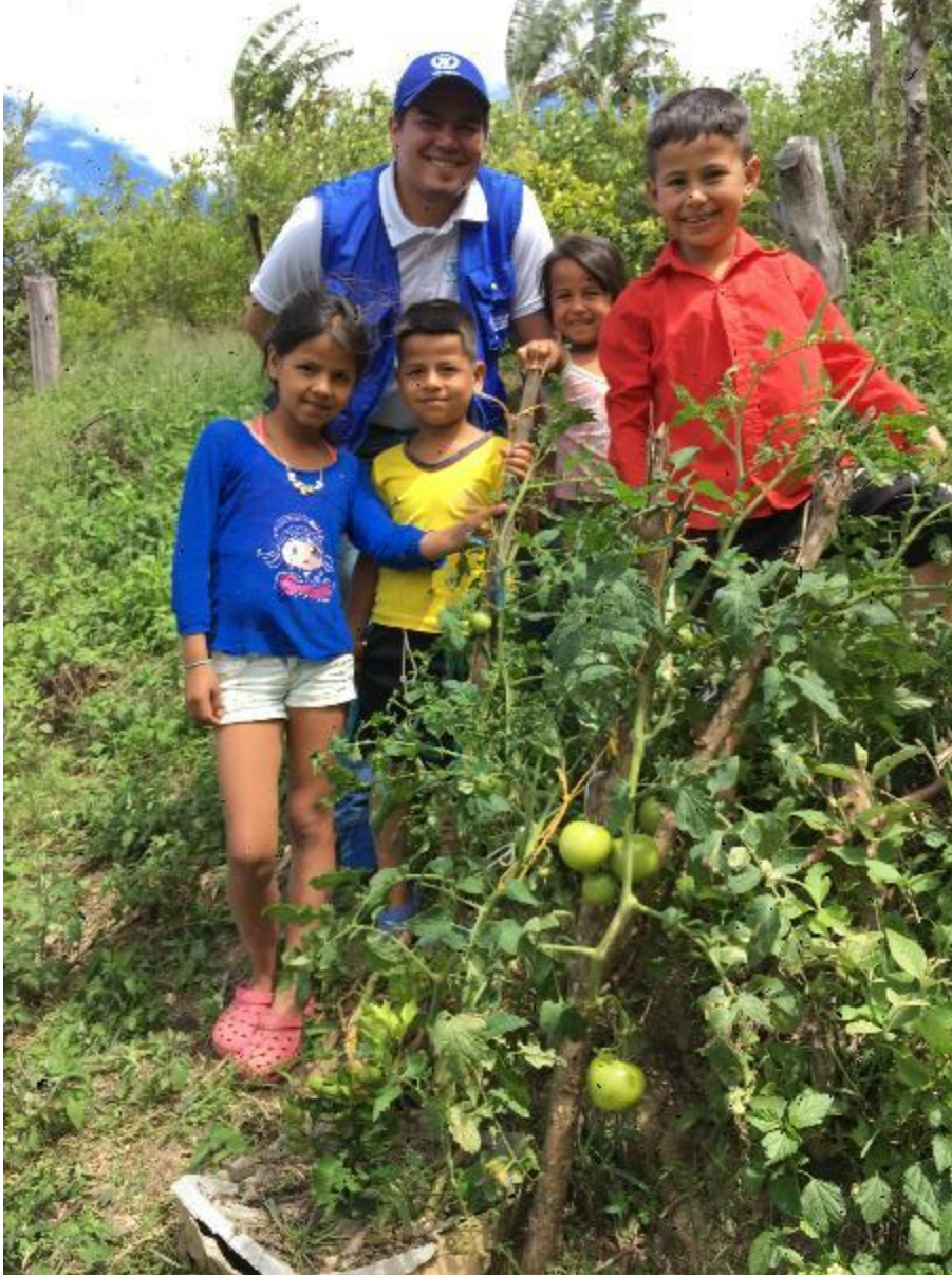
GB # 592 – Tangerine of 64 cm + 15 tomatoes Chonto- Photo taken on June 18 th 2019, Altillo.

Groasis has been designated as National Icon by the Dutch Government for being one of the 3 most innovative projects of The Netherlands with a high social impact and supporting economic growth.