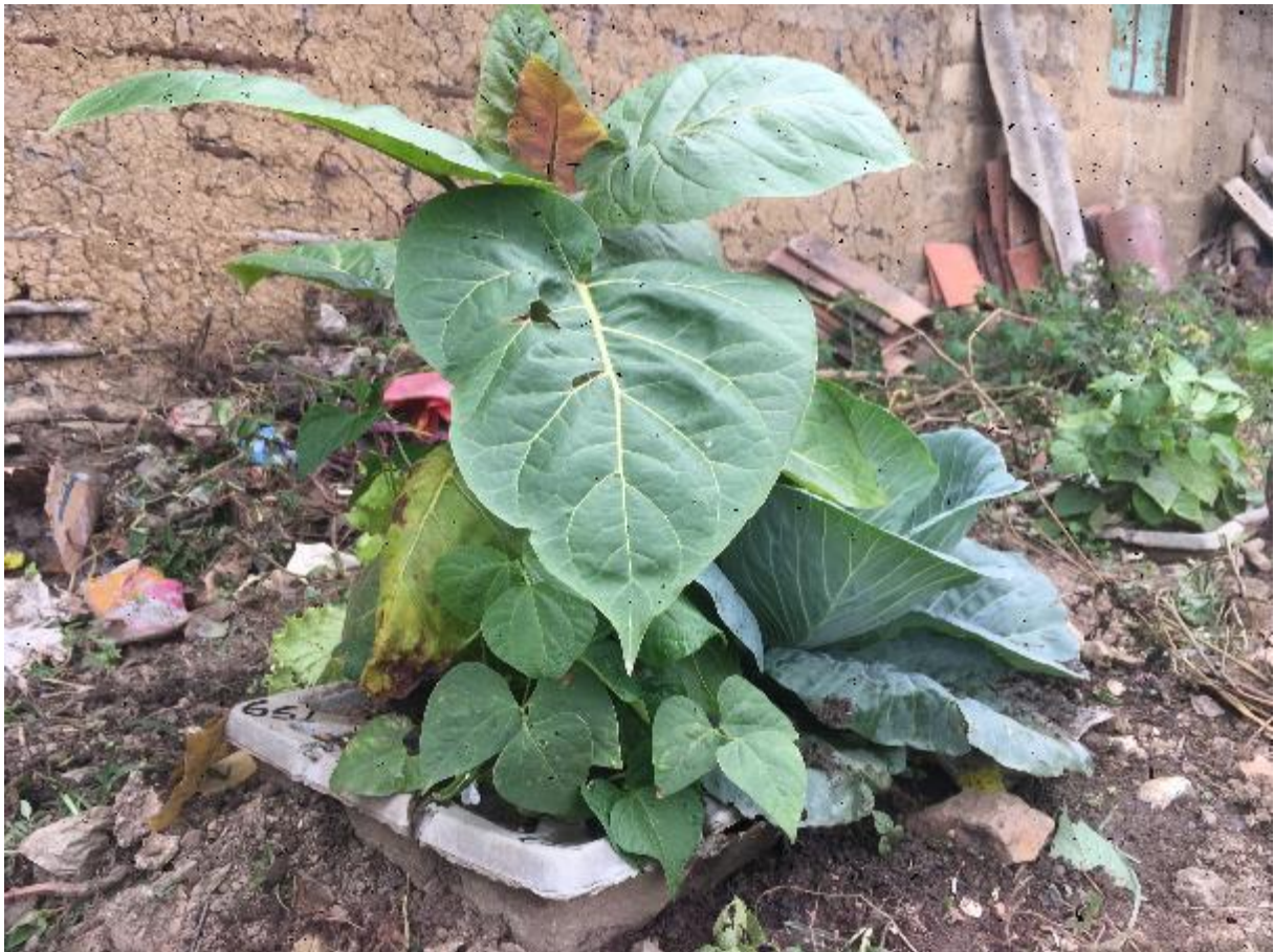
GB # 651 –Tree tomato of 77 cm + crispy lettuce + cabbage +beans. 4 vegetables and 1 tree in one box. Photo taken on June 17 th 2019, in La Herradura.

Groasis has been designated as National Icon by the Dutch Government for being one of the 3 most innovative projects of The Netherlands with a high social impact and supporting economic growth.