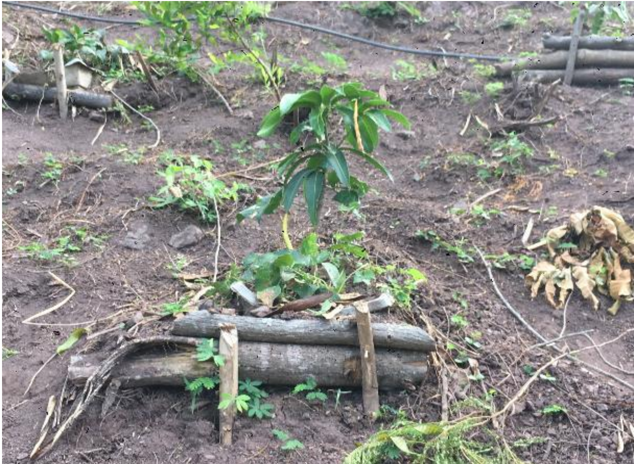
Farm in Tarabita 1 with pieces of firewood protection in the Growboxx to avoid landslides. Photo taken on June 20 th 2019.

Groasis has been designated as National Icon by the Dutch Government for being one of the 3 most innovative projects of The Netherlands with a high social impact and supporting economic growth.