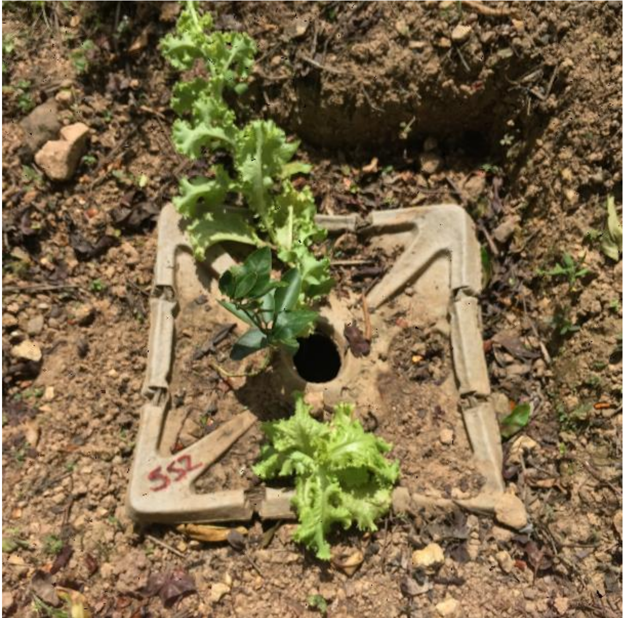
GB # 552 –Tangerine of 42 cm + crispy lettuces -Photo taken on June 18 th 2019, in Yacuanas.

Groasis has been designated as National Icon by the Dutch Government for being one of the 3 most innovative projects of The Netherlands with a high social impact and supporting economic growth.