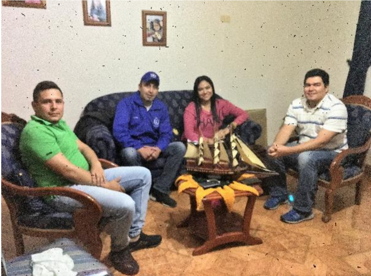
20190617 Meeting WFP – Groasis in Almaguer.