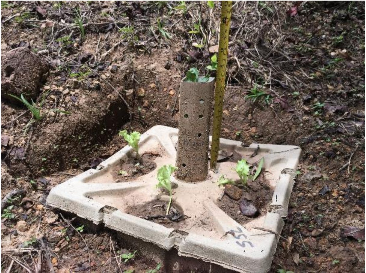
GB # 552 – Tangerine of 20 cm + crispy lettuces -Photo taken on March 12 th 2019, in Yacuanas.