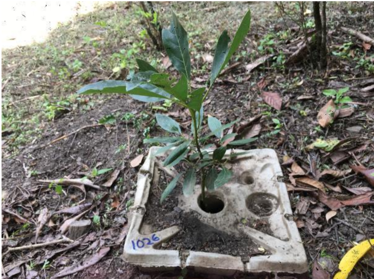
GB # 1026 Avocado of 71 cm. Photo taken on June 20 th 2019, in Sauji.