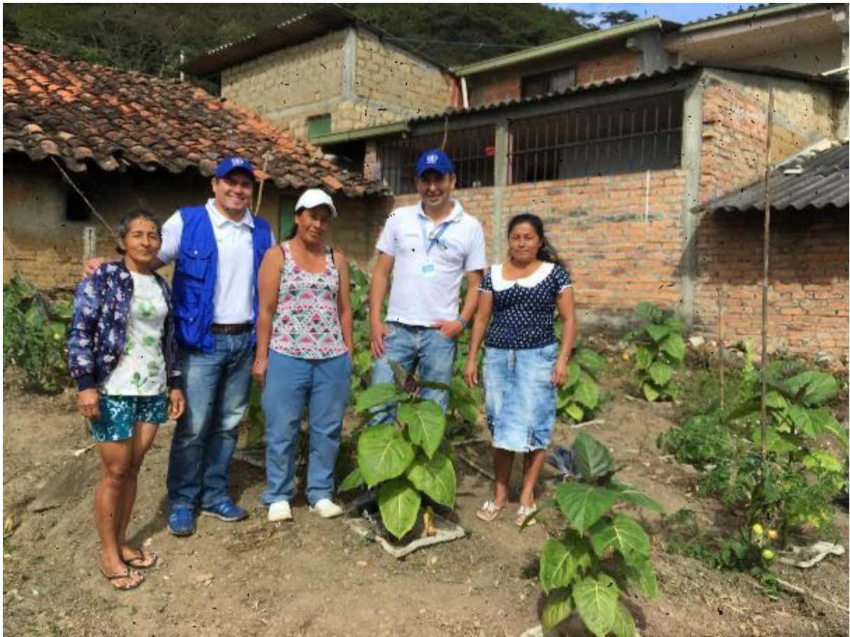
General view of the crop, WFP staff with La Herradura group. Photo taken on June 17 th 2019, La Herradura.

Groasis has been designated as National Icon by the Dutch Government for being one of the 3 most innovative projects of The Netherlands with a high social impact and supporting economic growth.