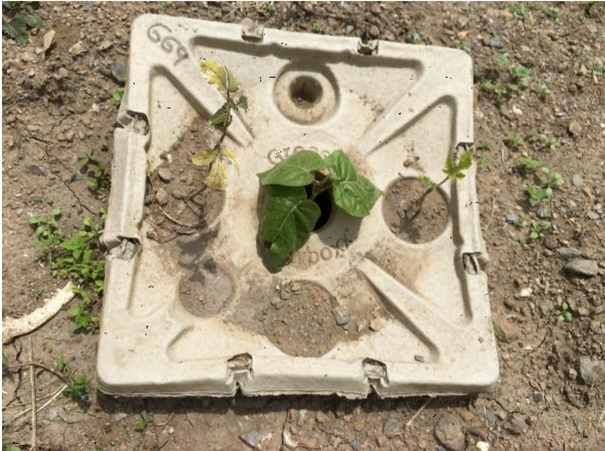
GB # 669 –Tree tomato in the center + 2 little tomatoes seedlings – Photo taken on March 11 th 2019 in La Herradura.