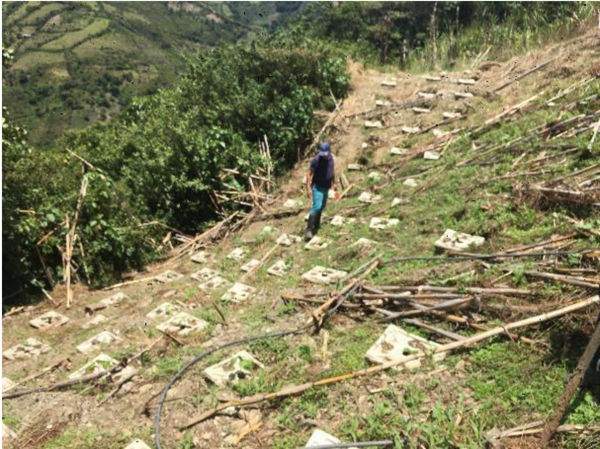
Top view of Groasis Growboxx with tree tomatoes in Gabrielas. Photo taken on March 15, 2019.

Groasis has been designated as National Icon by the Dutch Government for being one of the 3 most innovative projects of The Netherlands with a high social impact and supporting economic growth.