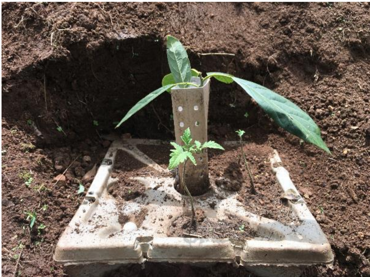
GB # 457 – Avocado + beans. Photo taken on March 12 th 2019, in Yunga.