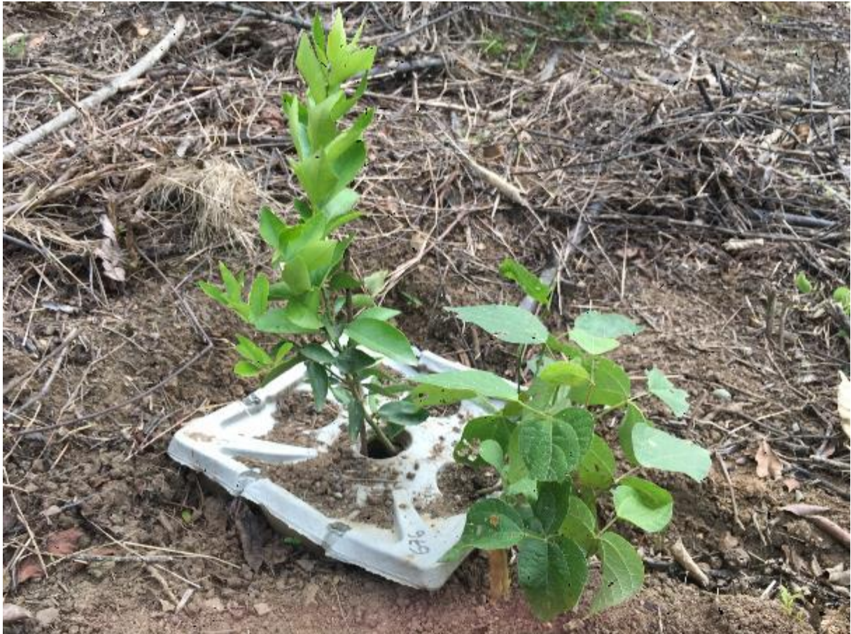
GB # 676 –Lemon tree of 78 cm. and beans. In this photo, you can also see the positive influence of the environment. Photo taken on June 17 th 2019, Pitayas 2.

Groasis has been designated as National Icon by the Dutch Government for being one of the 3 most innovative projects of The Netherlands with a high social impact and supporting economic growth.