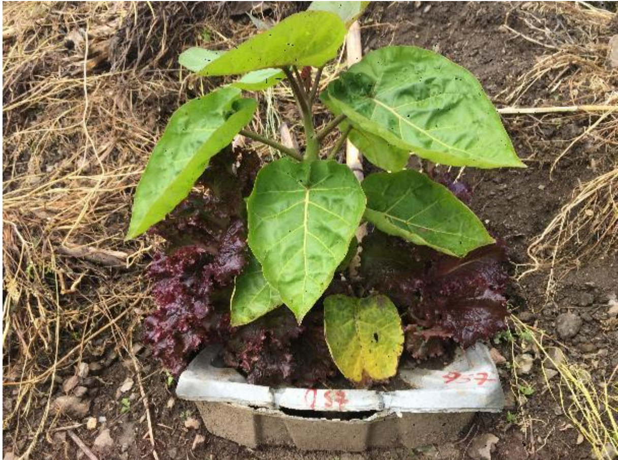
GB # 957 tree tomato of 72 cm + 2 purple lettuces. Photo taken on June 21th 2019, in Gabrielas.

Groasis has been designated as National Icon by the Dutch Government for being one of the 3 most innovative projects of The Netherlands with a high social impact and supporting economic growth.