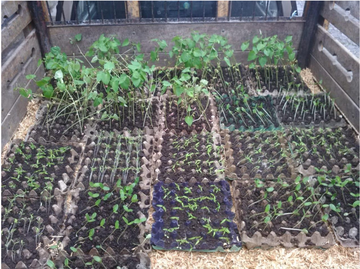
Short cycle vegetables, ready to deliver. Photo taken on April 4, 2019.

Groasis has been designated as National Icon by the Dutch Government for being one of the 3 most innovative projects of The Netherlands with a high social impact and supporting economic growth.