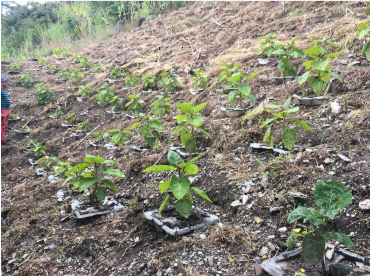
View from below of Groasis Growboxx with tree tomatoes in Gabrielas. Photo taken on June 21, 2019.

Groasis has been designated as National Icon by the Dutch Government for being one of the 3 most innovative projects of The Netherlands with a high social impact and supporting economic growth.