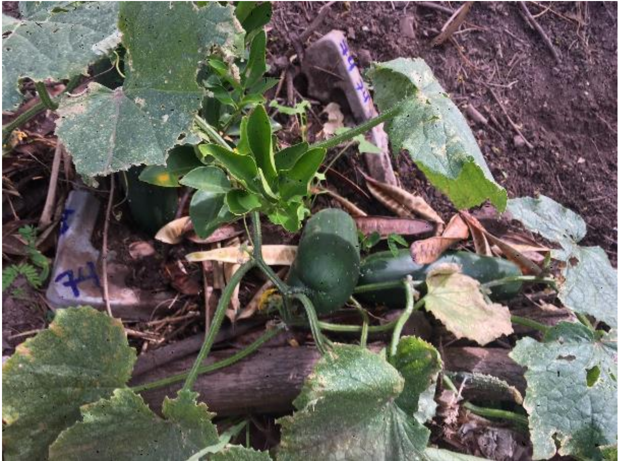
Gb # 74 Mango of 52 cm + cucumbers. Photo taken on June 20 th 2019, in Tarabita 1.

Groasis has been designated as National Icon by the Dutch Government for being one of the 3 most innovative projects of The Netherlands with a high social impact and supporting economic growth.