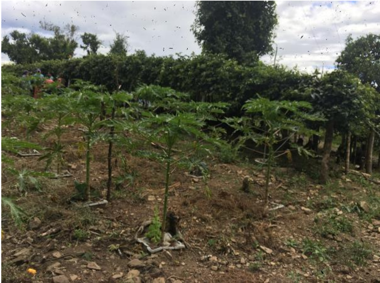
View of the crop with Growboxx - Photo taken on June 19 th . 2019, in Palizada.

Groasis has been designated as National Icon by the Dutch Government for being one of the 3 most innovative projects of The Netherlands with a high social impact and supporting economic growth.