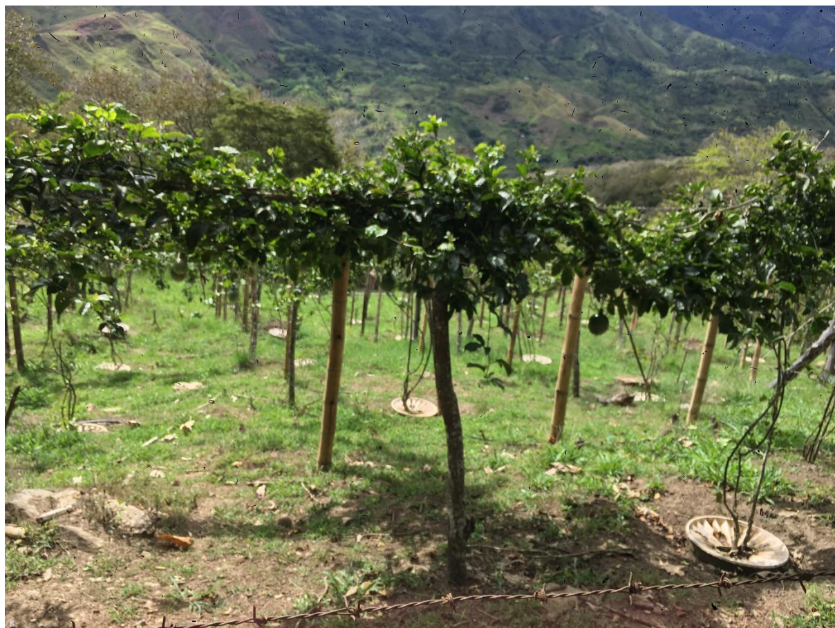
Crop with maracuyás = passion fruits. Photo taken on June 19 th 2019 in Elvecia.

Groasis has been designated as National Icon by the Dutch Government for being one of the 3 most innovative projects of The Netherlands with a high social impact and supporting economic growth.