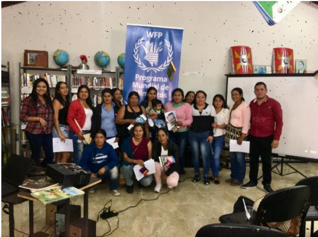
Group photo of all the participants in the exhibition. Photo taken on June 22, 2019.

Groasis has been designated as National Icon by the Dutch Government for being one of the 3 most innovative projects of The Netherlands with a high social impact and supporting economic growth.