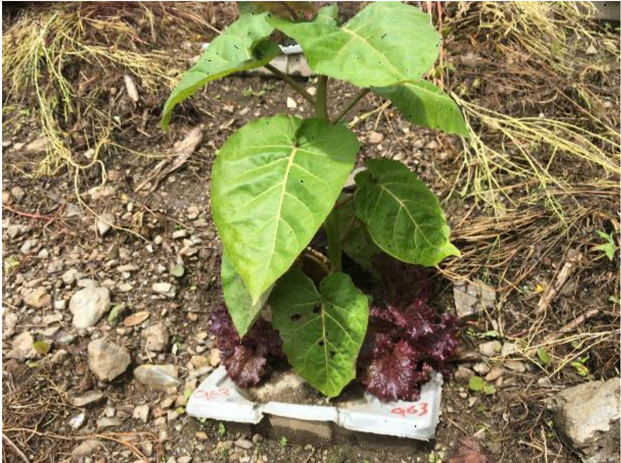
GB # 963 tree tomato of 84 cm + 2 purple lettuces. Photo taken on June 21th 2019, in Gabrielas.

Groasis has been designated as National Icon by the Dutch Government for being one of the 3 most innovative projects of The Netherlands with a high social impact and supporting economic growth.