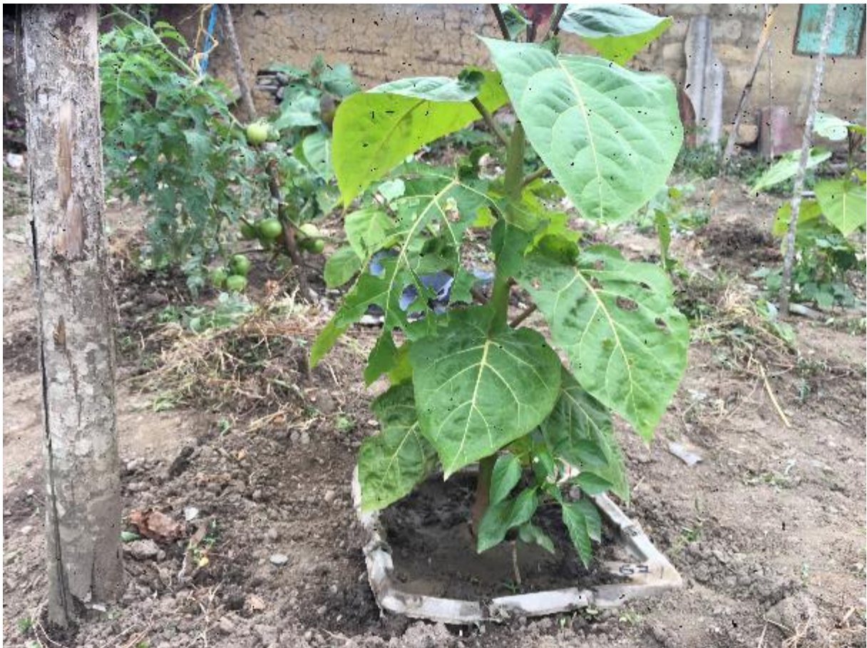
GB # 671 – Tree tomato of 106 cm in the center + Green pepper. Crispy lettuce was harvest last week. Photo taken on June 17 th 2019, in La Herradura.

Groasis has been designated as National Icon by the Dutch Government for being one of the 3 most innovative projects of The Netherlands with a high social impact and supporting economic growth.