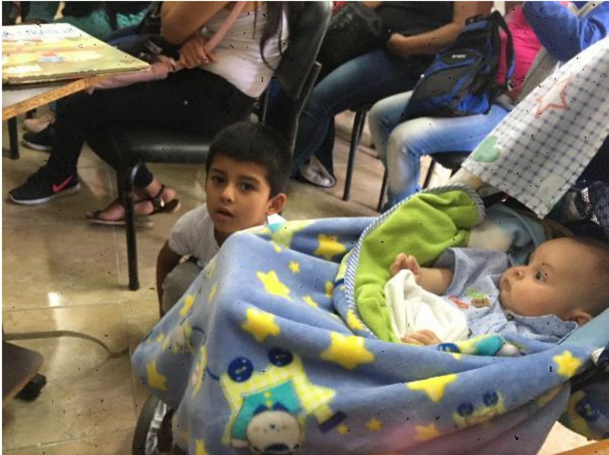
All the guests were very attentive to the talk, including the children. Photo taken on June 22, 2019.

Groasis has been designated as National Icon by the Dutch Government for being one of the 3 most innovative projects of The Netherlands with a high social impact and supporting economic growth.