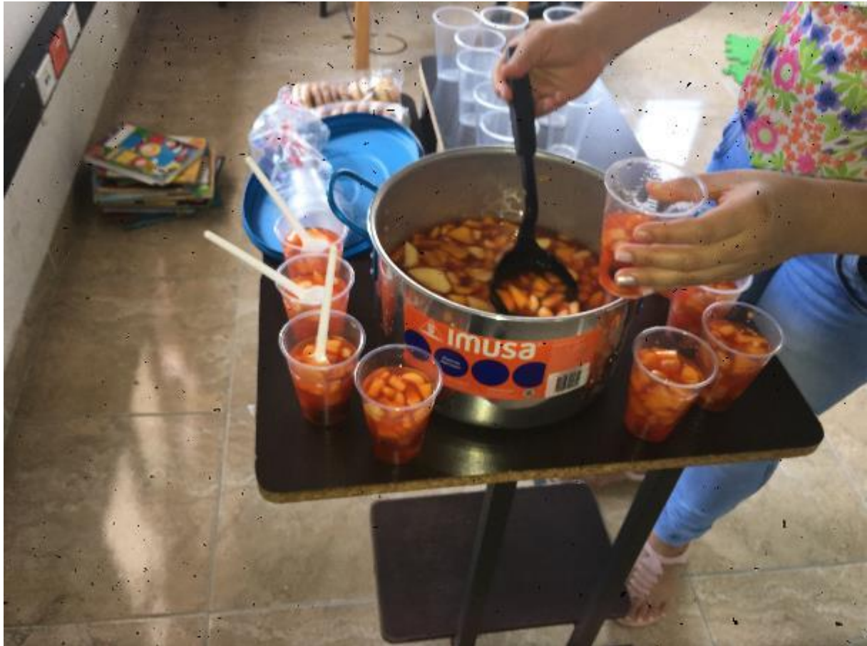
We share a healthy breakfast among all the participants. Photo taken on June 22, 2019.

Groasis has been designated as National Icon by the Dutch Government for being one of the 3 most innovative projects of The Netherlands with a high social impact and supporting economic growth.