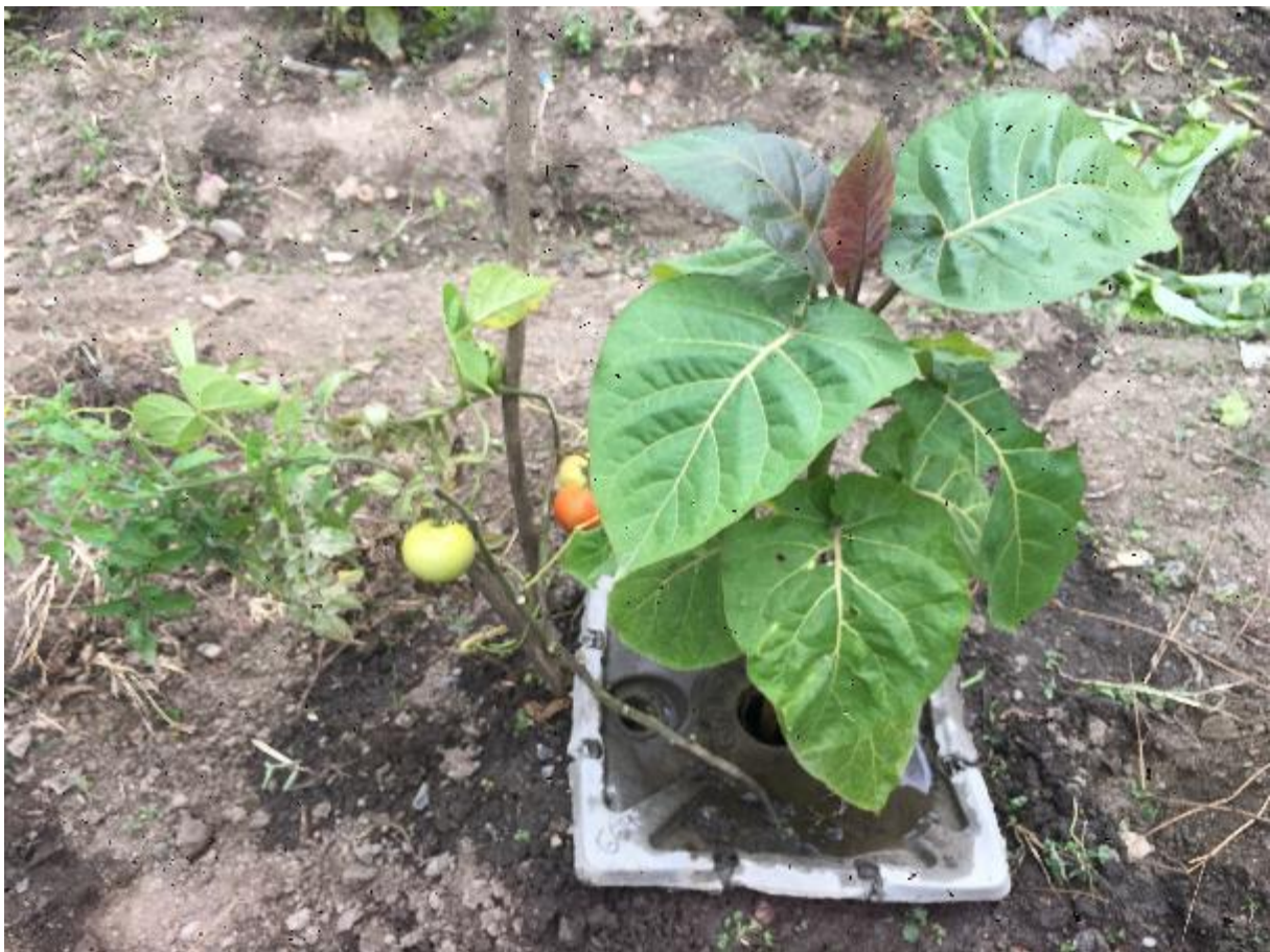
GB # 669 –Tree tomato of 86 cm in the center + tomatoes with fruits – Photo taken on June 17 th 2019 in La Herradura.

Groasis has been designated as National Icon by the Dutch Government for being one of the 3 most innovative projects of The Netherlands with a high social impact and supporting economic growth.