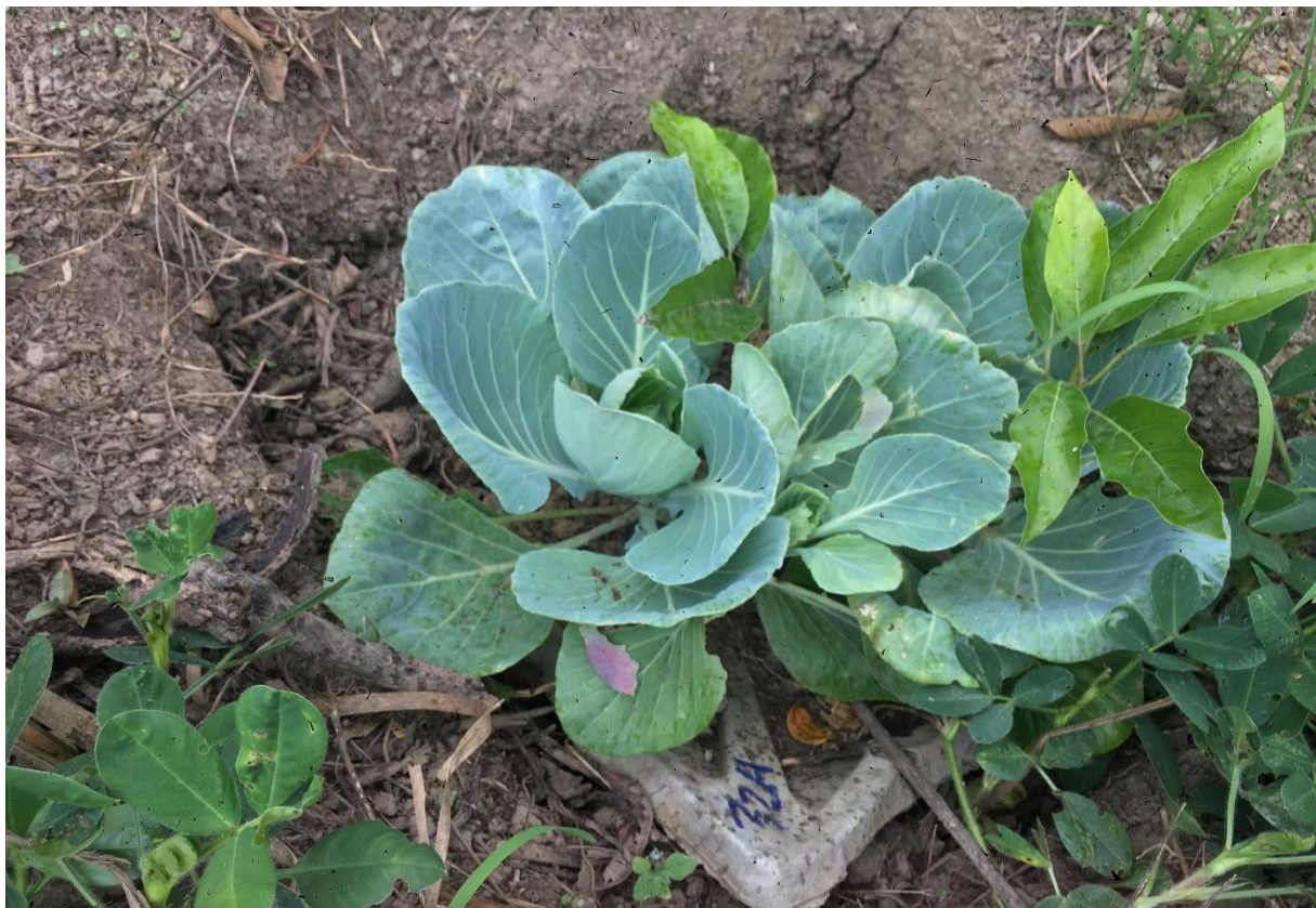
Gb # 324 Avocado of 59 cm + 2 cabbages. Photo taken on June 19 th 2019 in Gonzalo.