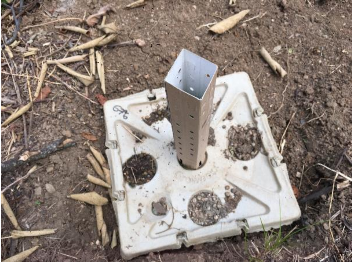
GB # 676 – Photo taken on March 11 th 2019 in Pitayas 2.

Groasis has been designated as National Icon by the Dutch Government for being one of the 3 most innovative projects of The Netherlands with a high social impact and supporting economic growth.