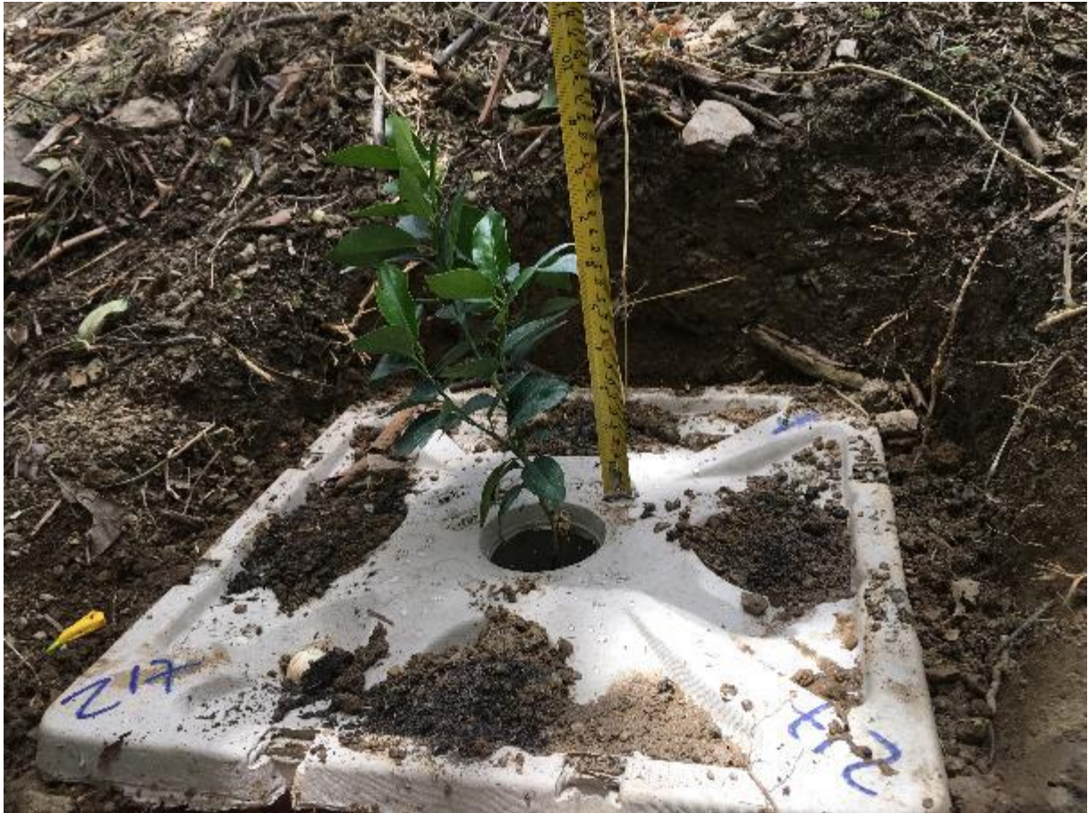
GB # 217 – Tangerine of 19 cm + seeds of beans – Photo taken on March 11 th 2019, in Casablanca.